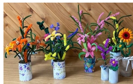
Results of the CCW Craft Days! Flower Bingo Prizes for the Nursing Home!