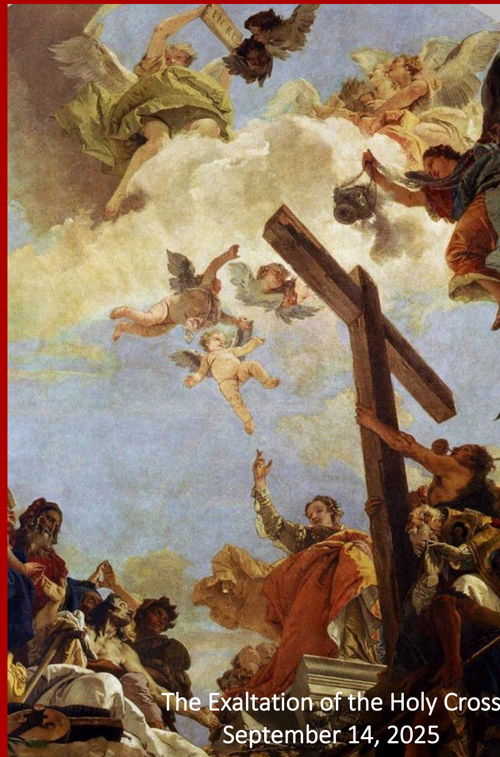
The Exaltation of the Holy Cross September 14, 2025

24138 Veteran's Memorial Hwy. P.O. Box 216 Hillman, MI 49746 Phone: 989-742-4542 Email: parishoffice@staughillman.org Diocese of Gaylord Website: dioceseofgaylord.org